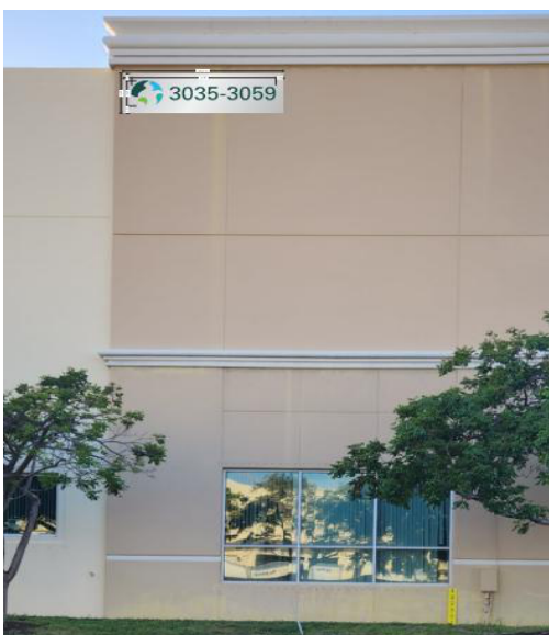
Examples of approved placements shown above